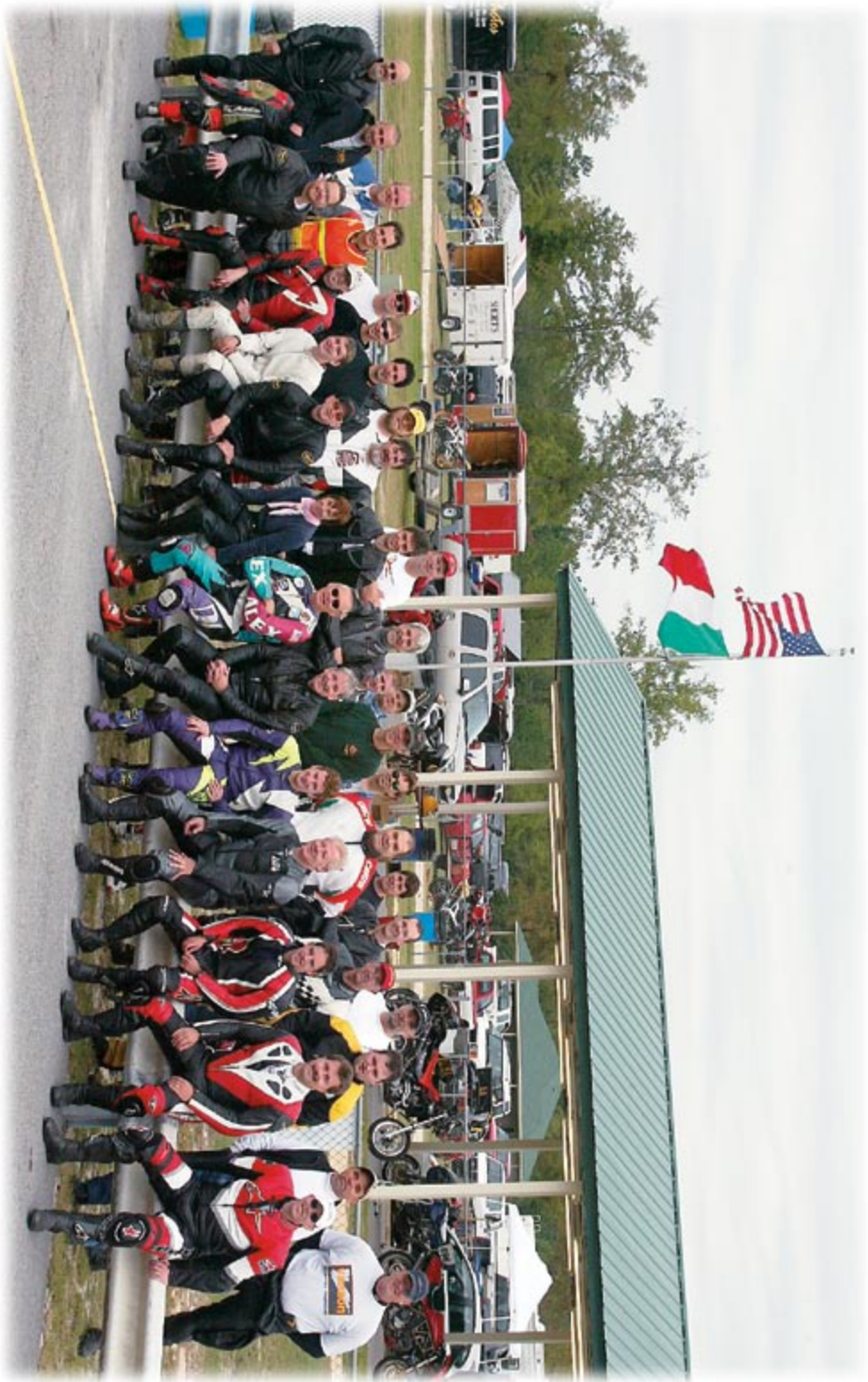
Track Day • October 2002 Carolina Motorsports Park